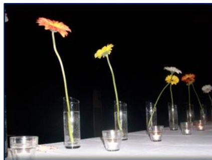
April 2010 Celebration of Donors, Human Anatomy Program